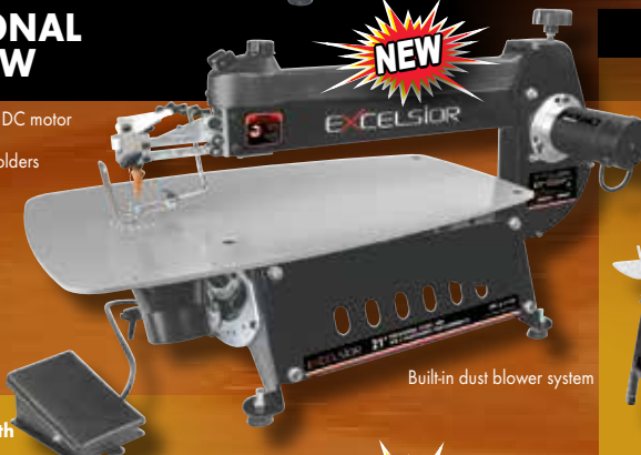
Built-in dust blower system