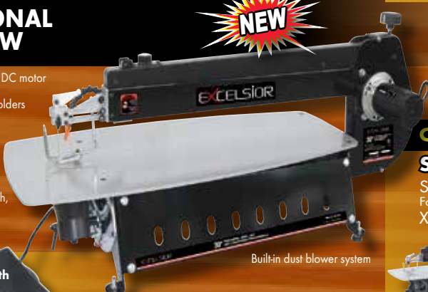
Built-in dust blower system