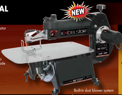
Built-in dust blower system