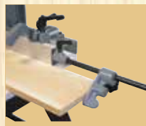
Adjustable fence work stops and extension work stops