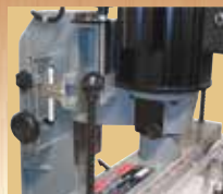
Adjustable height stop and depth stop